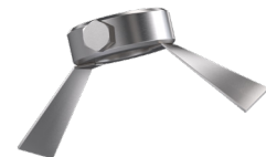
AGITATOR BLADES ('D' BLADE)