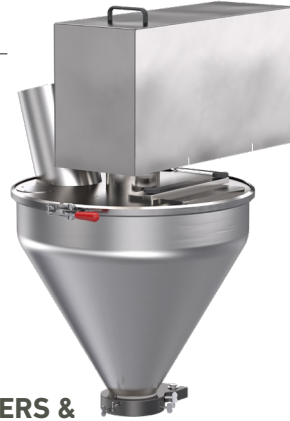
HOPPERS & HOPPER COVERS