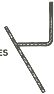
AGITATOR BLADES (STANDARD OR FLAKE)