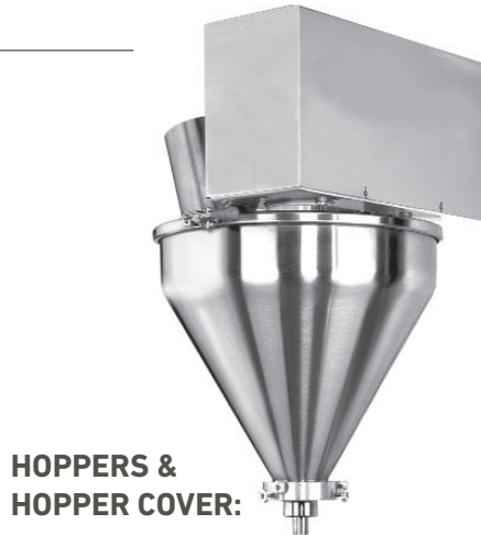
HOPPERS & HOPPER COVER: